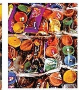
चाकलेट और बिस्कुट के साथ पैकेट में पैक बच्चों द्वारा तैयार दीये।

सजावटी वस्तुएं उपलब्ध कराई हैं। बच्चों को दीपावली के अर्थ और महत्व के बारे में बताया गया। बच्चों को दीपावली के अर्थ और महत्व के बारे में बताया गया। बच्चों को दीपावली के अर्थ और महत्व के बारे में बताया गया।