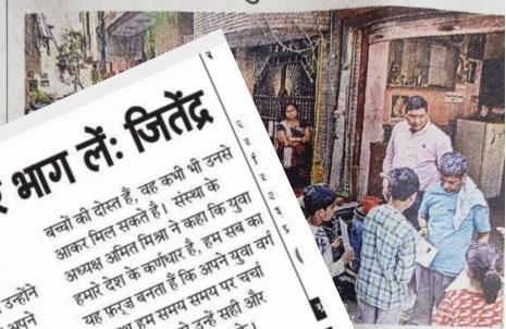
बच्चों ने घरो व बांटे और लोगों को कि वह पानी रासायनिक संस्था के पे कहा बहुत