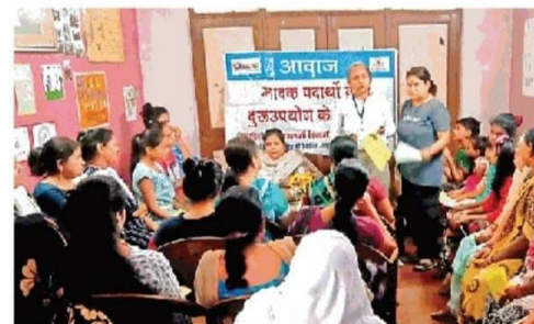
कक्षा कक्ष में मादक पदार्थों के दुष्प्रभाव पर आयोजित जागरूकता कार्यक्रम में भाग लेते।