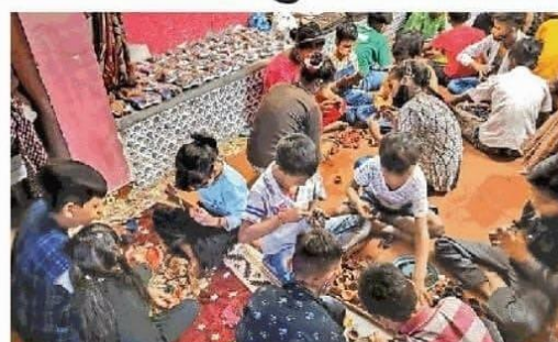
फिशन कुज में मिट्टी के दीयों की सजावट करते बच्चे।

संवाददाता, पूर्वी दिल्ली : दीपावली, रेशनी का त्योहार है, जिसमें दीयों की रोशनी चार चांद लगाती है। दीपावली को लेकर हर यु-वर्ग के लोगों में खूब उत्साह फैला हुआ है। दीपावली के दिन रेशनी के फटाके और चारों तरफ से मनेगी झुग्गी के बच्चों की दीपावली। रेशनी के फटाके और चारों तरफ से मनेगी झुग्गी के बच्चों की दीपावली। रेशनी के फटाके और चारों तरफ से मनेगी झुग्गी के बच्चों की दीपावली।